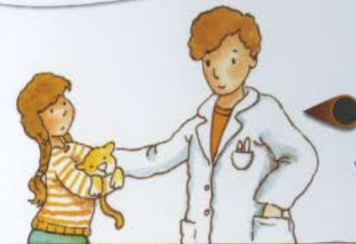
beli mantil white coat