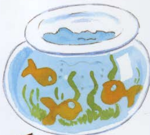
zlatna ribica goldfish