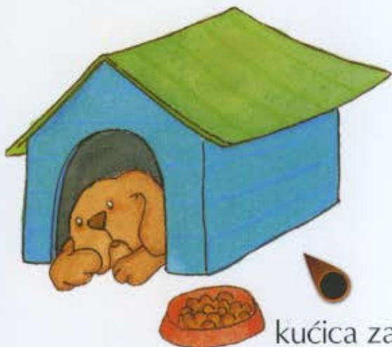
kućica za pse kennel