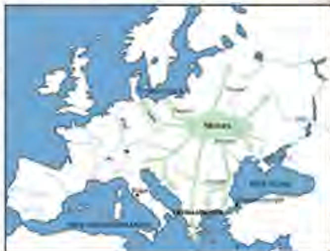
Migration of the Slavs: 5 th and 6 th c.

At that time, however, the lands of the Serbs did not form a single state, but were inhabited by tribes led by the archonts , the heads of the tribal states. The Serbs were not in control of their own lands at this time, but the Byzantine