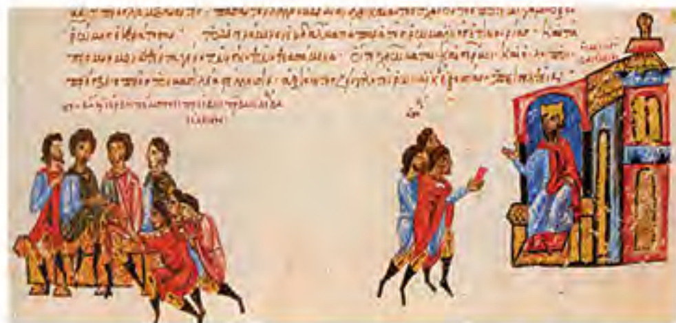
The Audience of the Serbs and Croats to Byzantine Emperor Basileus I, manuscript 9 th c. Chronicle of John Skylitres ( Ioannis Skylitrae Synopsis Historiarum 811–1057 )

Christianity at that time was not divided by schisms, and converted territories were under the jurisdiction of the place where they received the new faith. The territories under Rome's Salona (Split) jurisdiction were Croatia and the River Neretva region. Byzantium had strong authority through Duess (Drač), Zahumlje (Hum) and the Metropolitan of Sirmium (Sremska Mitrovica). Sremska Mitrovica was one of the capitals of the Eastern Roman Empire, which was destroyed by the pagan Hungarian invaders in the 9 th century.