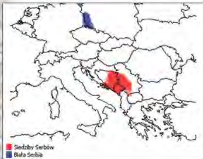
Migration of the Serbs 7 th c. Serbia in the 9 th -10 th c.

Latin and Greek literacy spread most quickly and where Catholicism and Orthodoxy came face to face - with varying success.