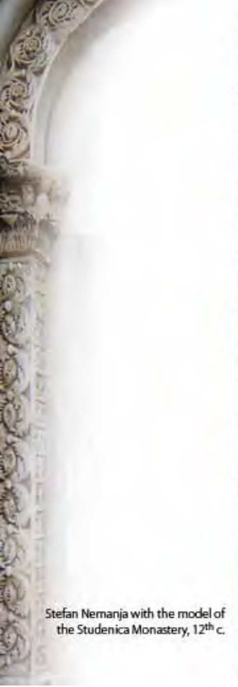
Stefan Nemanja with the model of the Studenica Monastery, 12 th c.