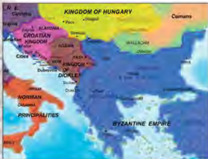
South-Eastern Europe 1080 AD. The zenith of Dukljan (Zeta) power during King Bodin's rule

Serbs performed a delicate balancing act between the two religious powers. This lasted until St Sava, youngest son of Stefan Nemanja, founded the Autocephalous Serbian Orthodox Church in 1219, during the reign of his brother, King Stefan the First Crowned.