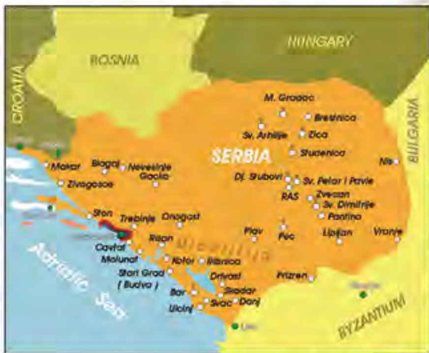
Map of Serbia during Stefan Nemanja's rule