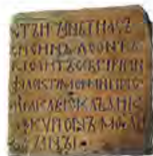
Ternic Inscription of 10 th –11 th c. National Museum of Belgrade This is one of the oldest Old Slavonic Scripts found in the region of Ternic, Serbia. There are engraved names of 40 martyred saints contained within it. Medieval builders believed that tablet would protect their buildings.