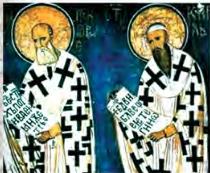
St Cyril and St Methodius, fresco, 12 th c.

Nemanja made his name when fighting against Byzantium.