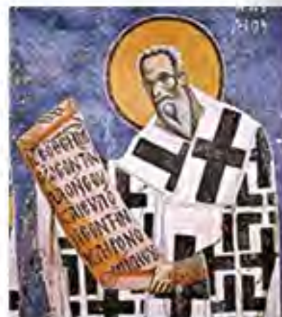
St Clement of Ohrid, 12 th c. fresco from the Church of St George in Kurbinovo, Prespa, Macedonia

However, the brothers began their historic work of translating the Bible into the Old Church Slavonic script, Cyril's original alphabet, the difficult Glagolitic. It was soon abandoned for a new Cyrillic alphabet, a more convenient script developed by Kliment (Clement), the Bishop of Ohrid (840–916), who was a disciple of Cyril and Methodius. The Cyrillic script was accepted by all Slavs of the Orthodox denomination, and is still used today in a modified form by Bulgarians, Russians, Macedonians and Serbs. At first they copied Cyril and Methodius' books, preserving the original text, but later they introduced the phonetic, morphological and lexicographical features of their living language into the original text.