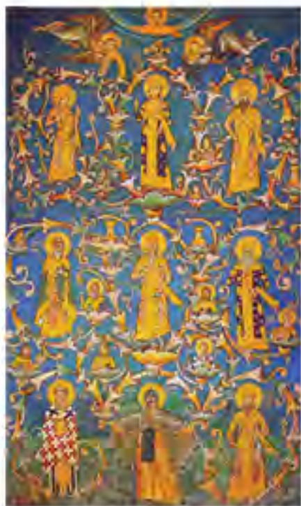
Nemanjić's Family Tree, the Dečani Monastery, 13 th c.